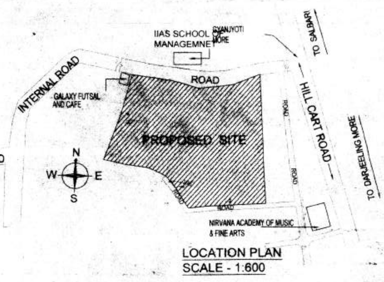
LOCATION PLAN SCALE - 1:800